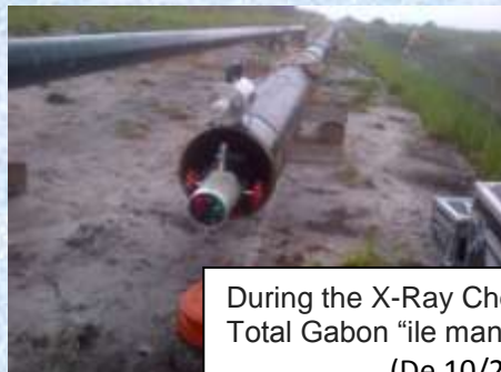
During the X-Ray Checks with crawler project Total Gabon "île manji" project 10 " & 8 " (De 10/2013 au 02/2015)