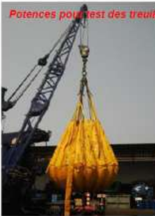
Potences pour test des treuils ou palans

Our technicians can also recertify cranes, fork lifts and all lifting machines